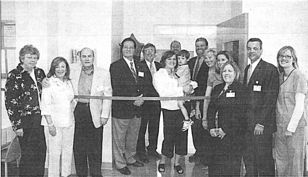
A GRAND EVENT – Servicing a population in Hudson County, the new facility will also be open for people from Bergen and Passaic counties and others throughout Northern New Jersey.