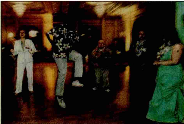
Guests at the beach luau prom take to the dance floor Sunday at the Woodbridge Hotel and Conference Center.